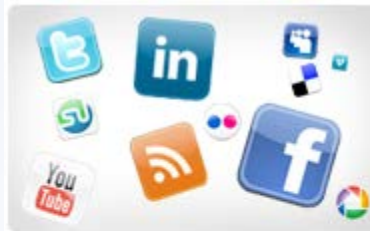
Social Networking & Media paradigms integrated with trading capabilities