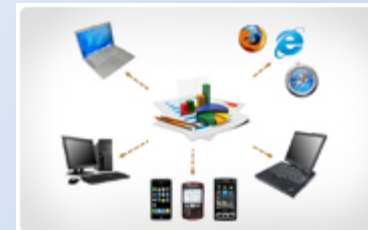
Advanced software development and systems integration