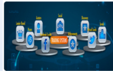
Gamification mechanics combined with trading systems