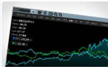
Rich Internet Application Design of trading front-ends