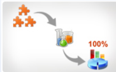
Business Intelligence for streamlining brokerage operations