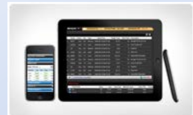
Mobile Trading platforms