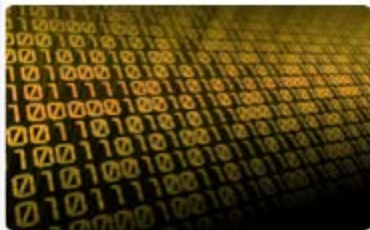
Algorithmic Trading, Smart Order Routing, real-time Risk Management and Analytics