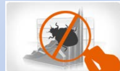
QA and Testing methodologies for Trading Systems